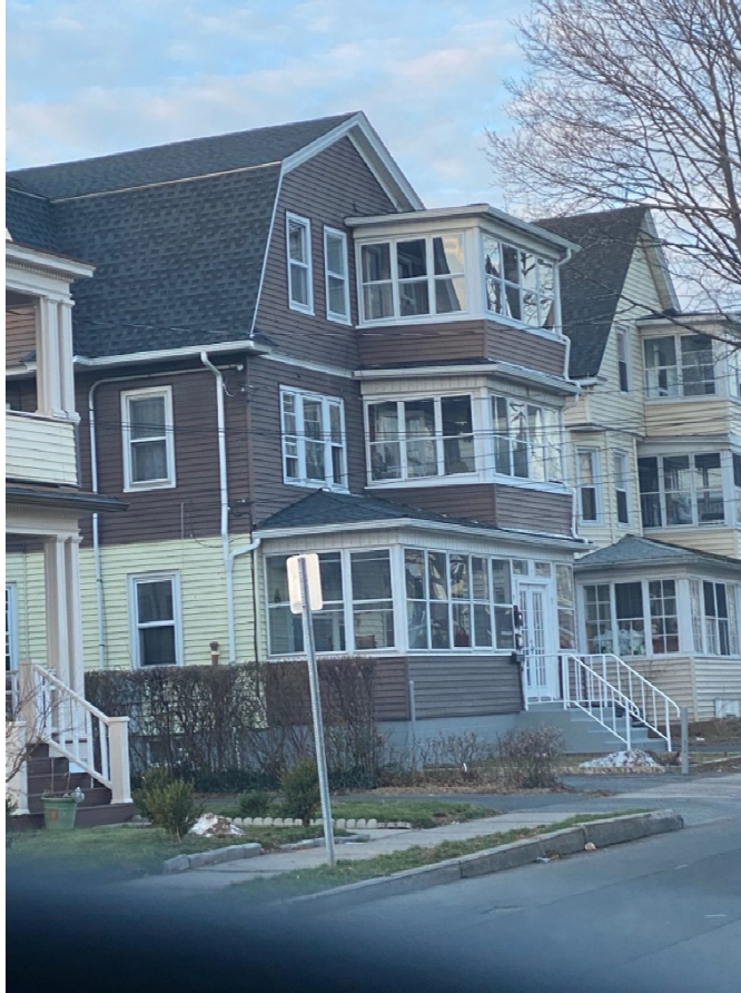
(The building that contains Target Location 5 )

On the front of the building that contains Target Location 5 there are two front doors. The door on the left accesses the first-floor apartment. NHDO TDS has not established a connection between the occupants of that first-floor apartment and the DTO. The door on the right leads to a staircase that provides access to both the second-floor apartment and Target Location 5 , i.e. , the third-floor apartment. NHDO TDS has not established a connection between the occupants of the second-floor apartment and the DTO. As described generally below and specifically in paragraph 75, surveillance has identified DTO member JUAN LNU and INDIVIDUAL A as occupying Target Location 5 . JUAN LNU and INDIVIDUAL A generally access their apartment through a side door of the building that contains Target Location 5 that leads to a stairwell that provides access to all three apartments.