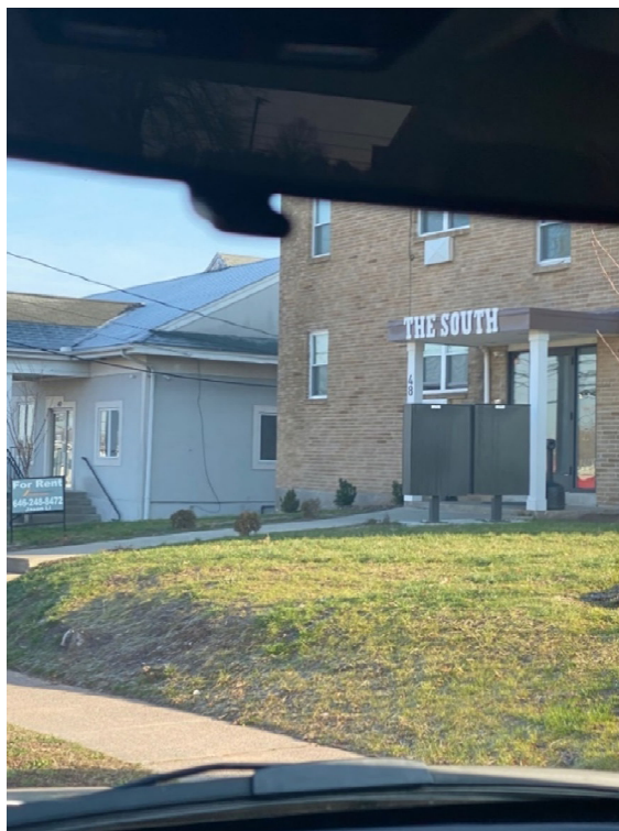
(The building that contains Target Location 4 )

stairwell, apartment B2 is located up the first stairwell and through an unlocked door into a common hallway. Apartment B2 is located on the south side of the building (closest to Rose Avenue) and is marked with “B2” on the white colored door. As described below in paragraph 70, NHDO TDS was able to establish that this particular apartment contained within the building is utilized by the DTO.