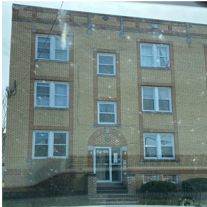
(The Front of the structure that contains Target Location 3 )

8A. Target Location 3 is located at 63 Colonial Street Apt# A, Hartford, CT. 63 Colonial Street is a light brown colored brick three-story apartment complex, believed to consist of twelve apartments. The building that contains Target Location 3 has a front door which leads to a common hallway to the apartment building. Target Location 3 is the first floor apartment on the left-hand side when facing the front of the building.