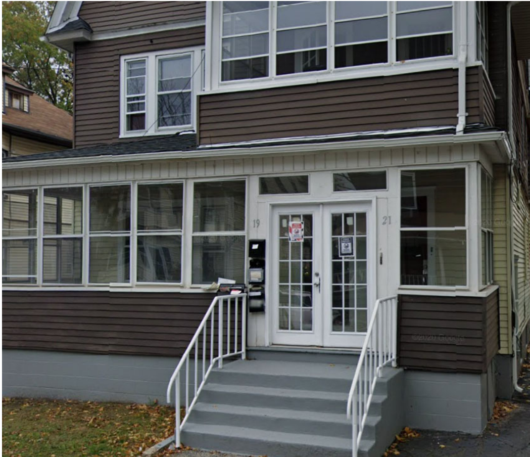
(The front doors to the building that contains Target Location 5 )