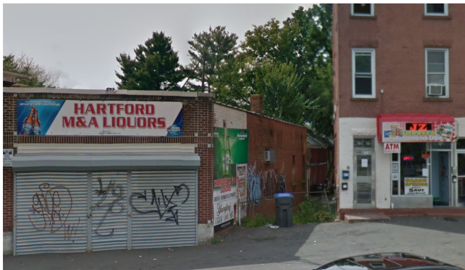
(Prestige Market now occupies the building on the left, JZ Tobacco on the right)

1 as a part of “Operation Fallen Kings.” NHDO TDS and the FBI began to work collaboratively on the investigation. Sometime during the month of May 2020, a structure fire in the building that housed WASHINGTON MARKET caused it to close for business. Since that time, the DTO has operated primarily out of Target Location 1 . Sometime during the month of January 2021, Investigators learned that the DTO had opened up “PRESTIGE MARKET” ( Target Location 2 ) located directly next to Target Location 1 with an address of 23 New Britain Avenue, Hartford, CT: