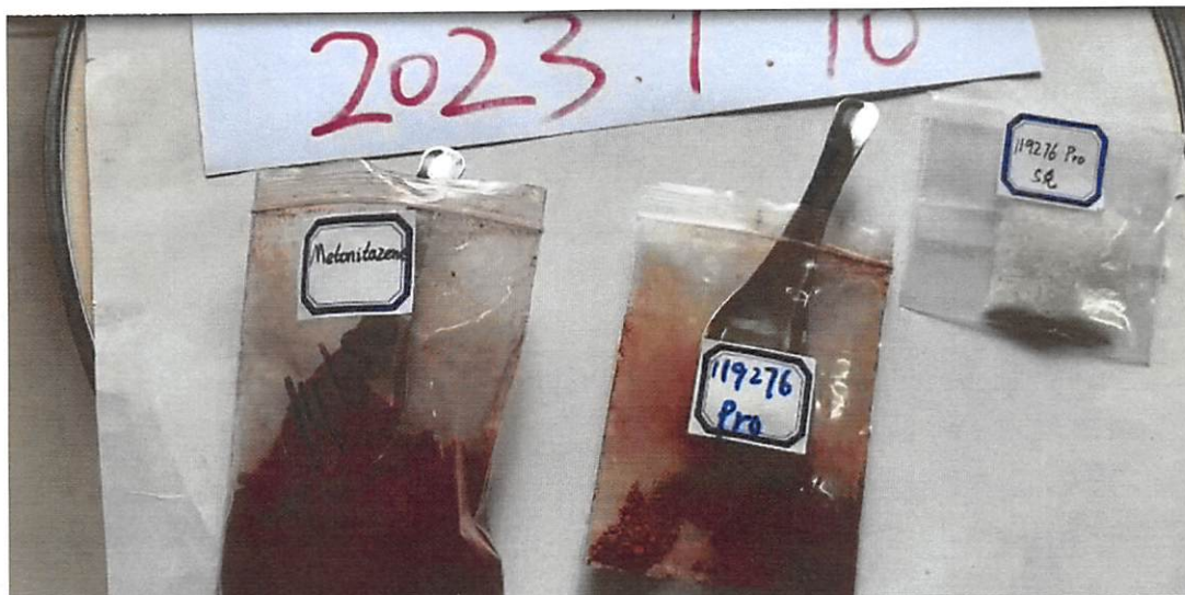
(Still shot from the video)

GUANGZHOU TENG YUE: The sample price of 1 kg is $7900, including freight and customs clearance.